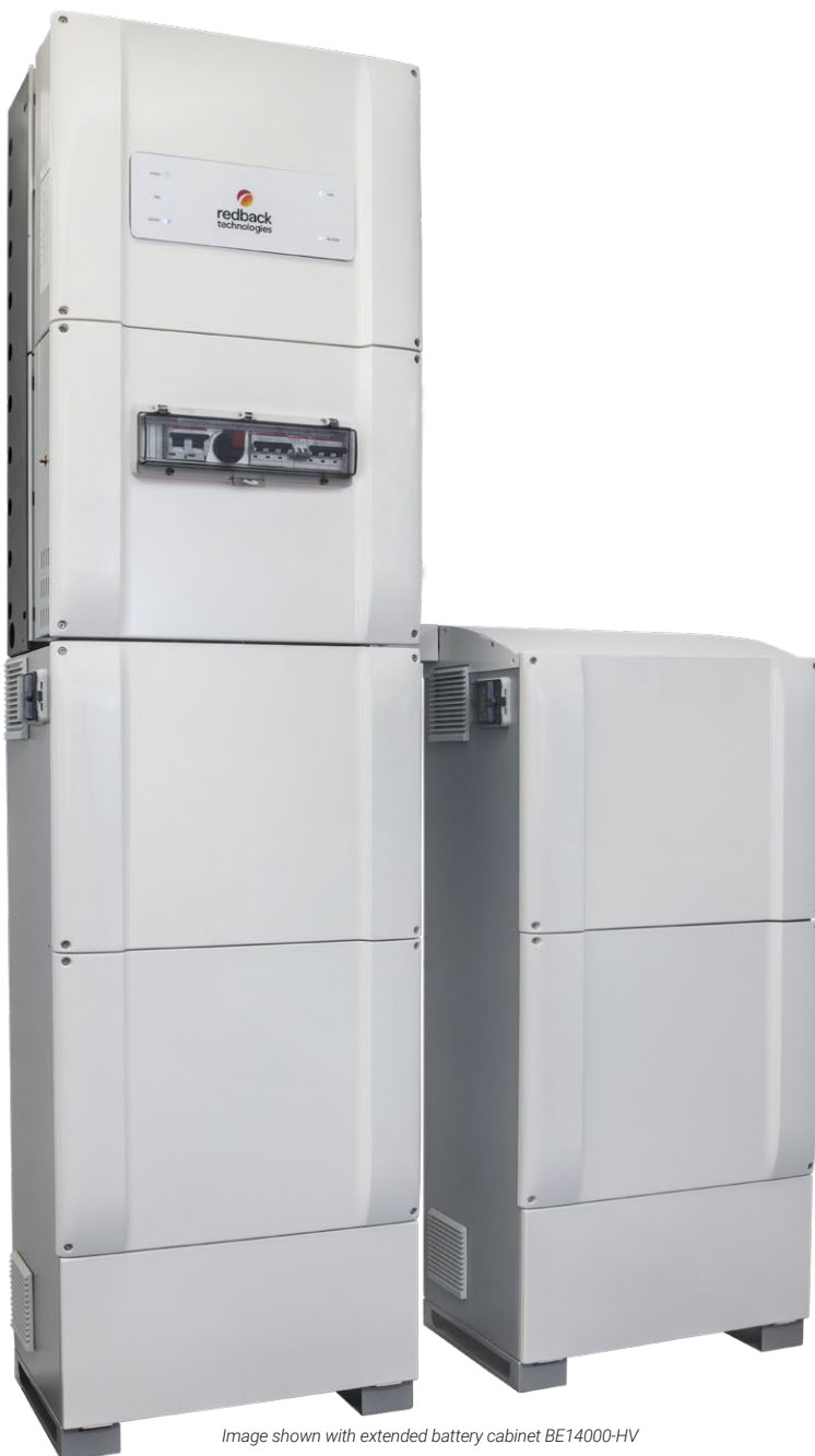
Image shown with extended battery cabinet BE14000-HV

The system combines a 10kVA solar inverter with two standard battery storage capacity options of either 9.6 or 14.2kWh and an option for an extended capacity of 19.2 or 28.4kWh. Site Manager allows installation of multiple systems at a single site to operate as a single system. The Smart 3-Phase Hybrid System also includes a pre-wired BoS and integrated isolators to ensure a fast and easy installation.